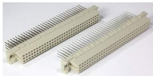
Old style solder New style solder