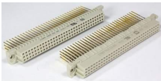
Old style press in New style press in

The new design is a one to one drop-in replacement